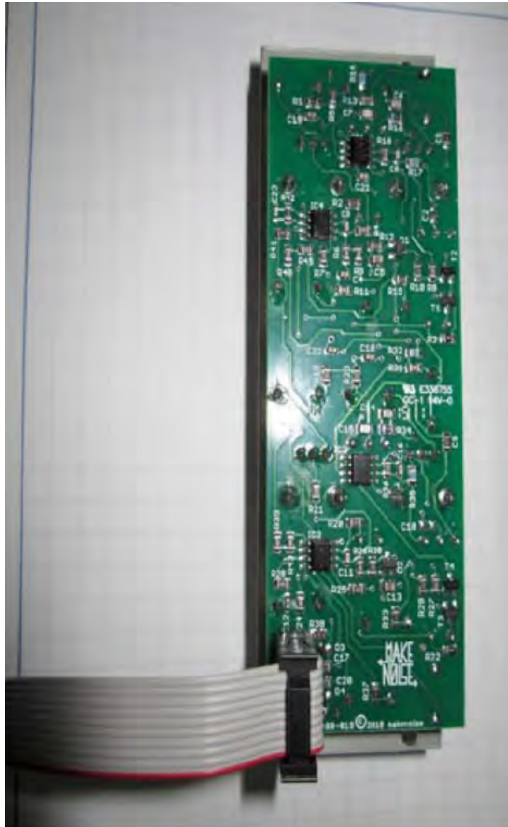
Proper installation of included power cable on module. Please note the RED BAND.

Please refer to your case manufacturers' specifications for location of the negative supply.